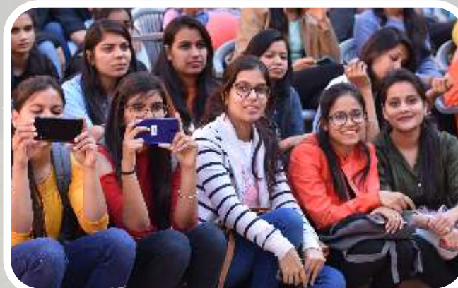
Tech Fest Selfi 2K19