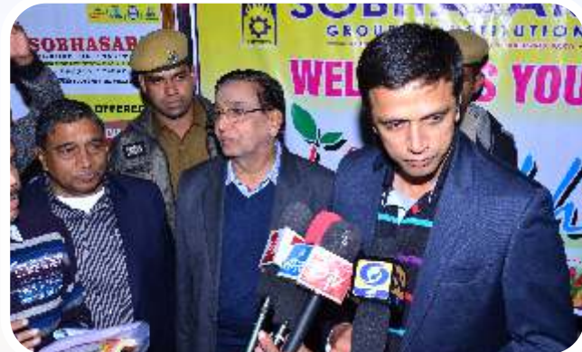
Rahul Dravid addressing Media