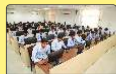
Fully AC Computer Center