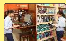
Fully AC Modern Library