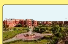
World Class Infrastructure