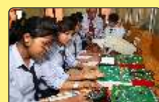
Well Equipped Labs