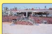
Fully AC Cafeteria