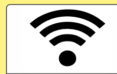
Free Wi-Fi Campus

नोट:- नवलगढ़, फतेहपुर एवं सीकर शहर के सभी प्रमुख स्थलों से बस सुविधा उपलब्ध है।