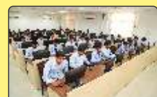
Fully AC Computer Center