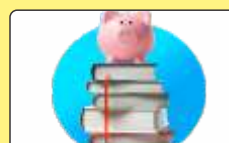
Book Bank Facility