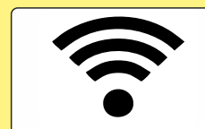
Free Wi-Fi Campus

नोट:- नवलगढ़, फतेहपुर एवं सीकर शहर के सभी प्रमुख स्थलों से बस सुविधा उपलब्ध है।