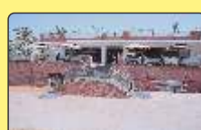
Fully AC Cafeteria