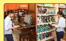
Fully AC Modern Library