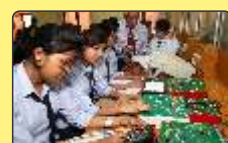
Well Equipped Labs