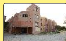
Separate Air Cooled Boys & Girls Hostels