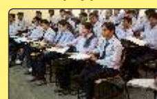
Well Equipped Classrooms