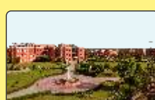
World Class Infrastructure