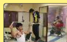
Fully Equipped Gym